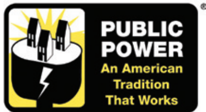
Public Power Week • October 3-9, 2010